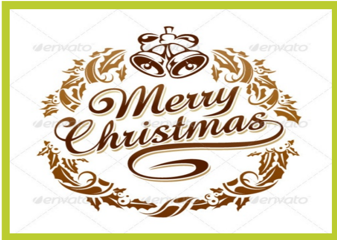
CHRISTMAS – 25/12/2014